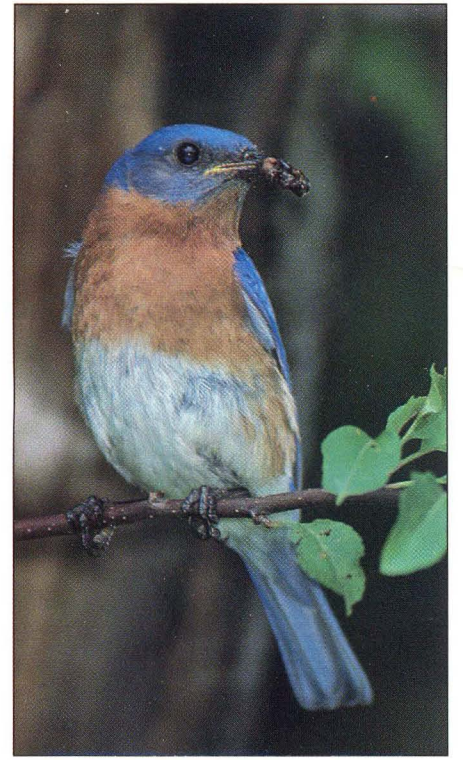
Your WILDTRUST donation of money can be applied to the state's ongoing bluebird restoration project . . .