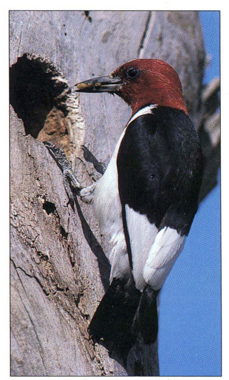
. . . or toward maintaining and preserving critical woody habitat that redheaded woodpeckers need to survive.