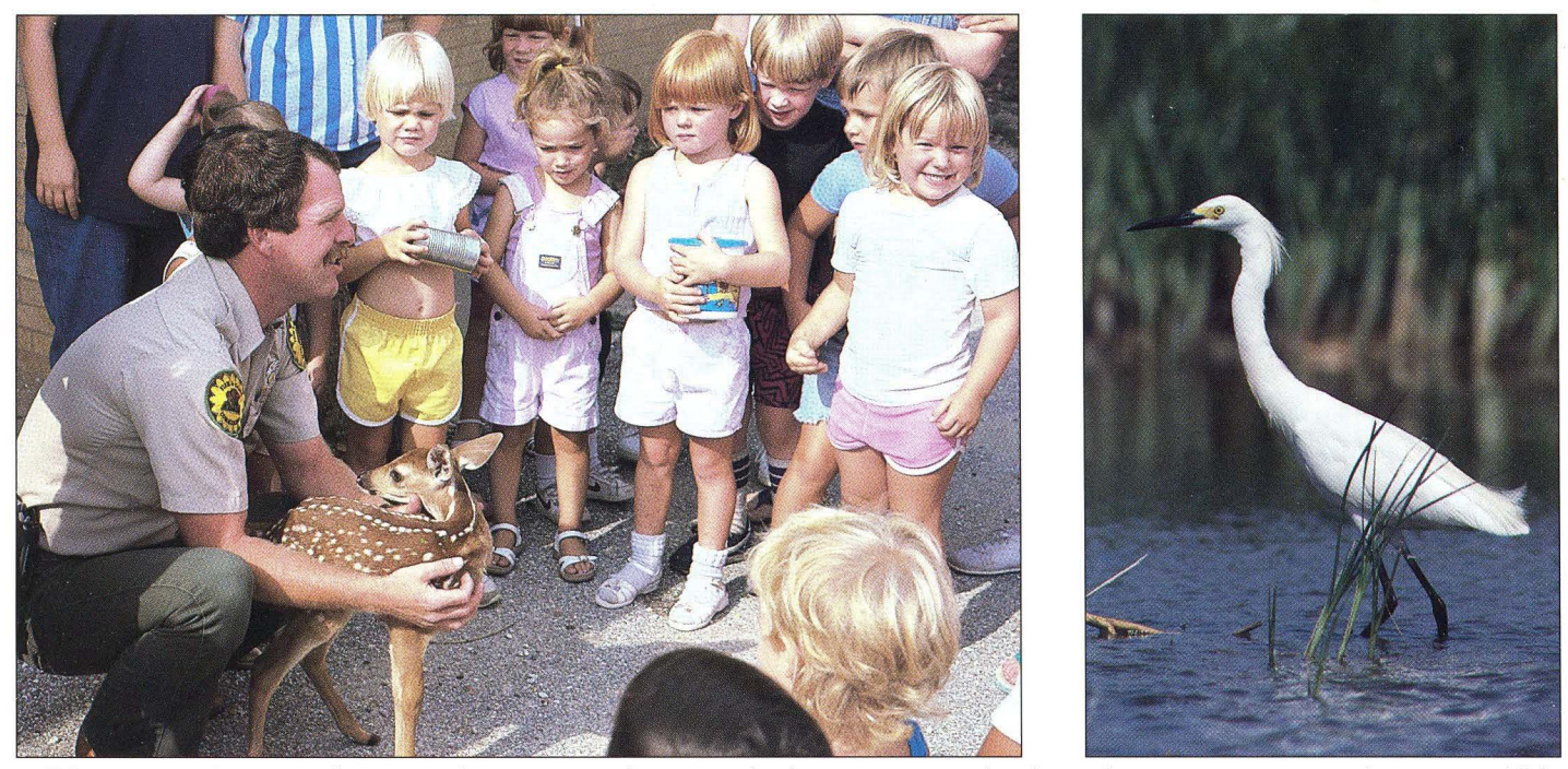
Buffalo roam on the Maxwell Game Refuge (on preceding page) thanks to a Kansan who donated property to preserve the native wildlife and prairie grass that covers the area. Other WILDTRUST donations have funded conservation education programs (left) and wetland habitat projects that benefit shorebirds (right).